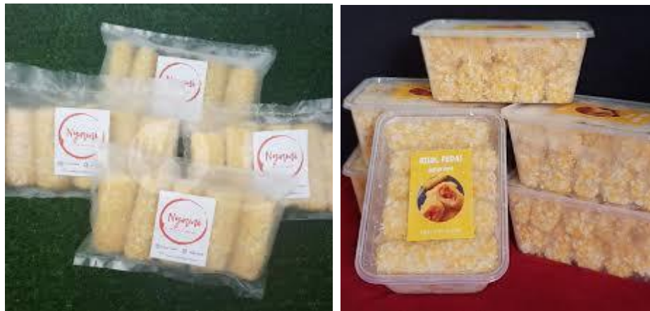
Figure 9. Fish Risoles Packaging