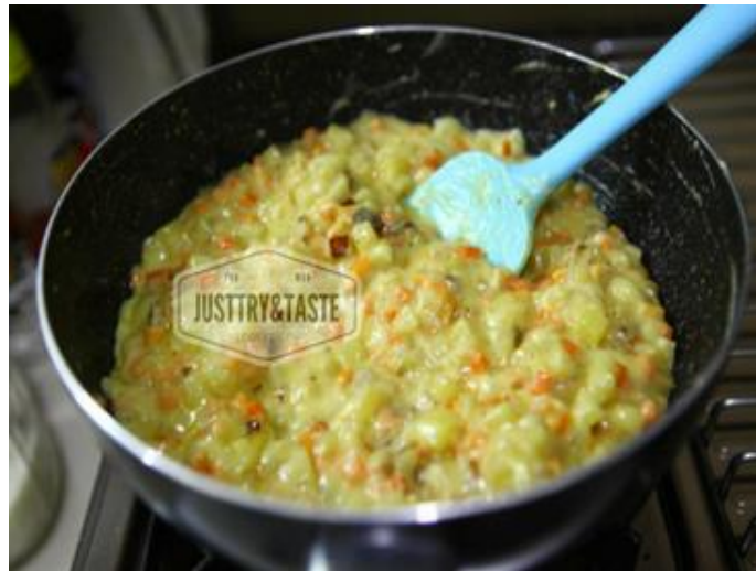
Figure 4. Stuffing