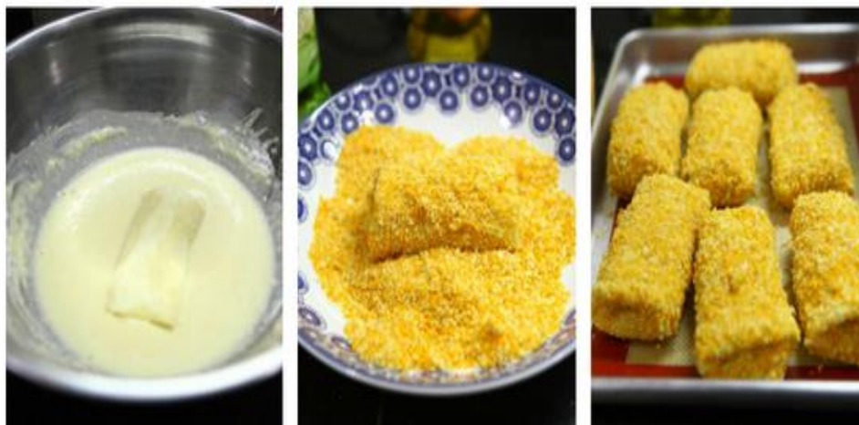
Figure 7. Buttering & Breading Fish Risoles