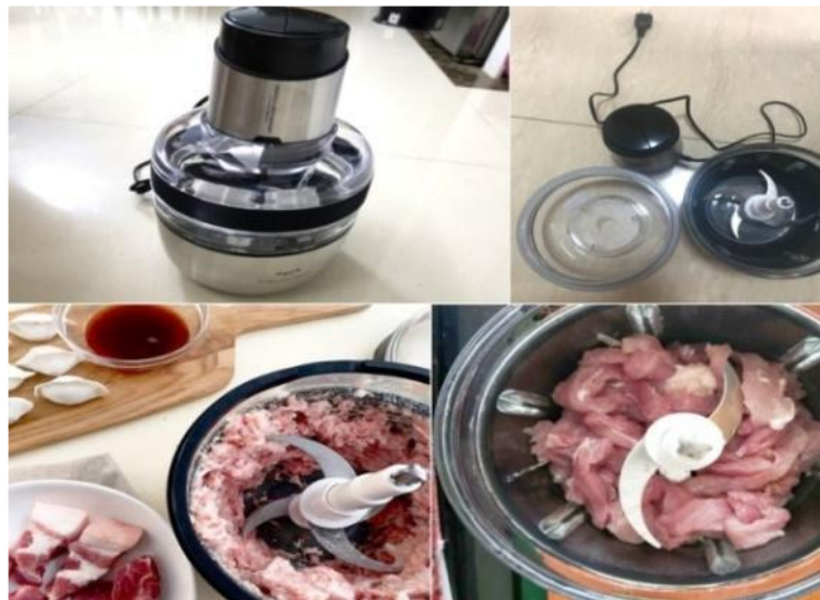
Figure 1. Puree the tuna