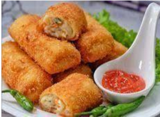
Figure 8. Fish Rissoles