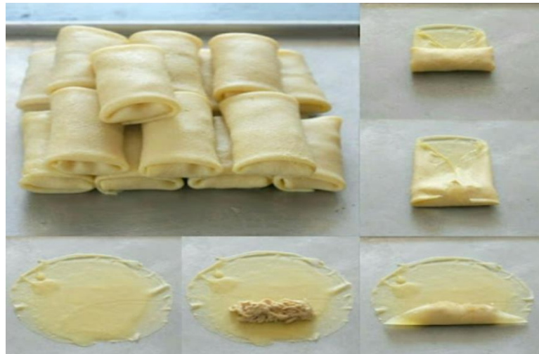
Figure 6. Forming Fish Risoles