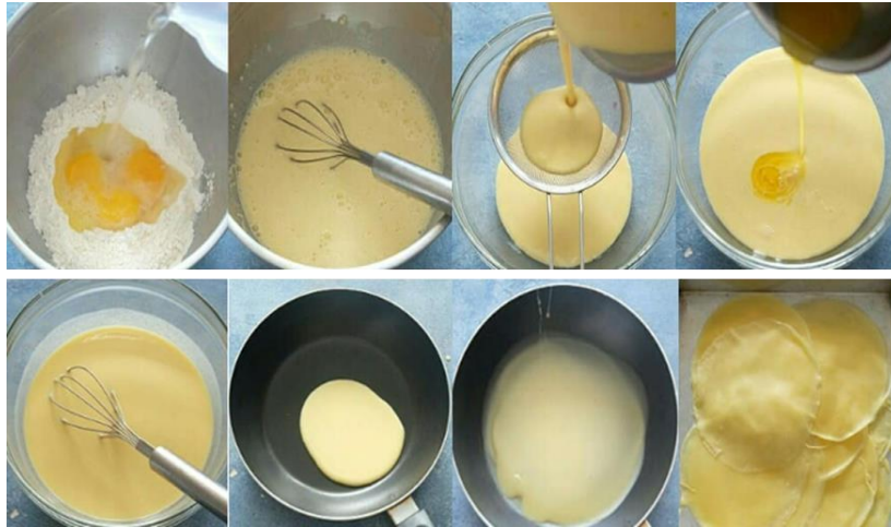
Figure 5. Making and Cutting Risoles Wrappers