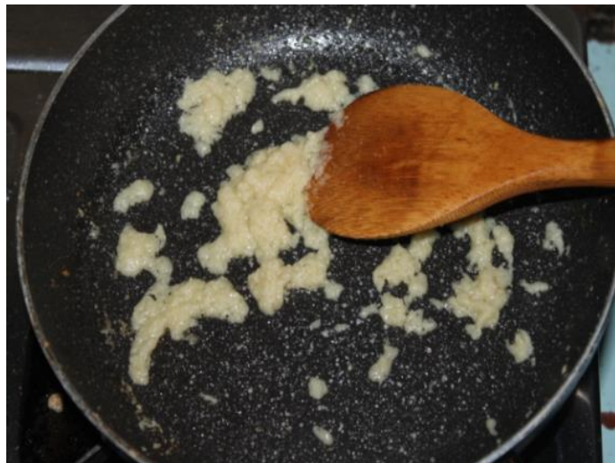
Figure 3. Sauteing the spices